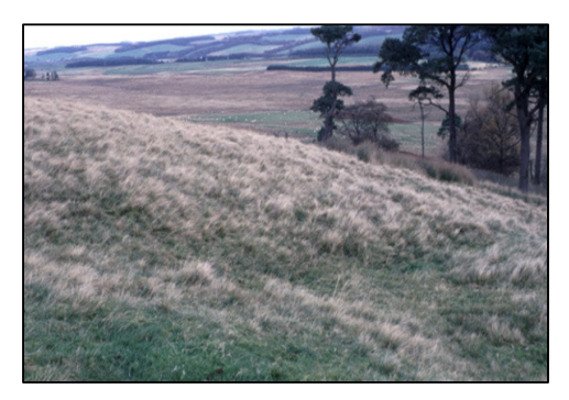
Quarry pit at Kilrubie Hill, with Eddleston valley in the background

In rough pasture on east facing slopes near the summit of Kilrubie Hill lie a small group of archaeological features. These are small and large scoops, humps and breaks of slope. Some are difficult to see in high vegetation, others are more obvious. Most are sub-circular, often broader than they are deep and less then 5m in maximum dimension, but some are as wide as 10m: few are deeper than 5m. There may be twenty scoops in total, varying in size and shape. But what are they – high on a hillside overlooking the Eddleston valley?